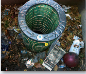
Device used to Capture Trash in Water Runoff

The proposed annual Clean Water fee may only be increased by the consumer price index, or two percent, whichever is less. This will help ensure that Clean Water fee revenues keep pace with the cost of operating and maintaining our clean water and pollution control services and facilities in future years. For more information, contact the Clean Water Program and/or review the Clean Water Fee Report available from the Program. Moreover, if approved, the Clean Water fee will be levied annually for a period not to exceed 10 years.