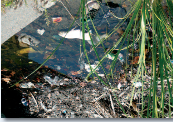
Trash in Creek