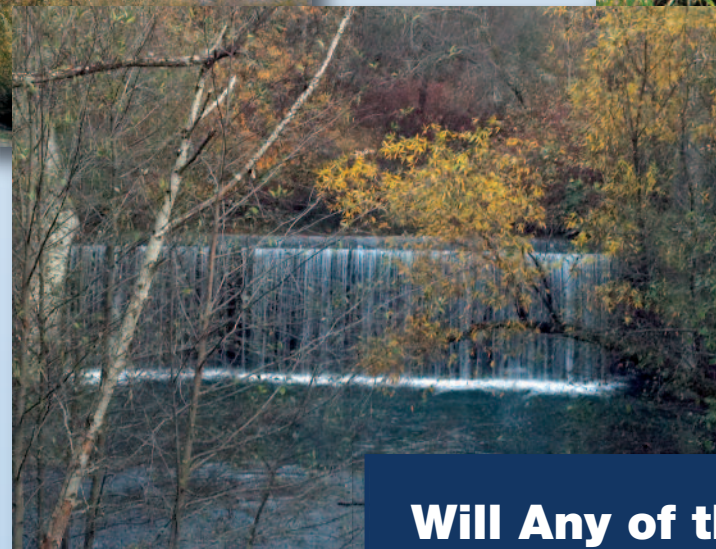
San Pablo Creek

If this measure is approved, the following local creeks and water bodies would benefit from clean water services and projects: